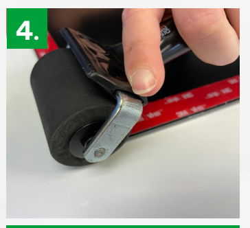
Bond strength increases over time