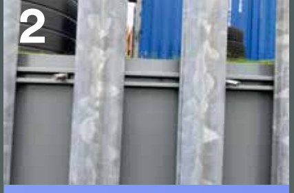
Slide the bolt heads into the channel, place the sign against the fence and position the bolt heads