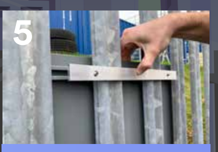
Repeat the process with the bottom run of channel to secure your sign