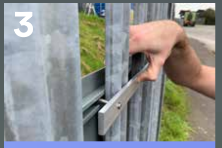
Position the flat bar over the bolts on the other side of the fence as shown